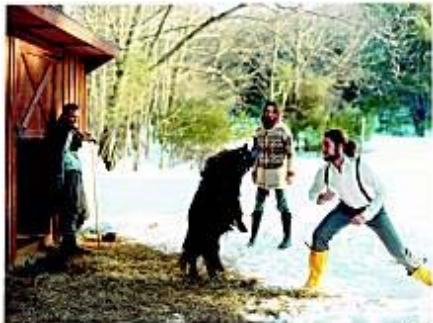
Eleanor Wood / Lauren Dukoff