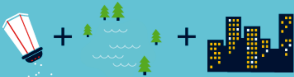
Salt Lake City, Utah