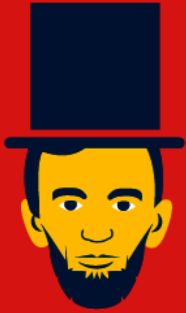
Figure out which capital each of these picture puzzles represents. Then match each capital to its state.