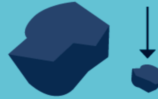
Little Rock, Arkansas